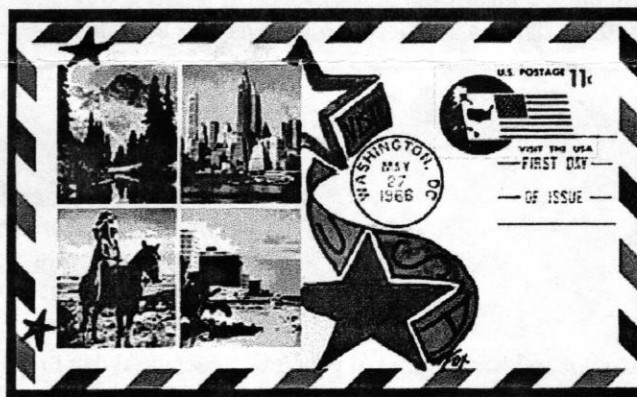
SCOTT #UXC5 FDI – MAY 27, 1966 MELISSA FOX "VISIT USA" ADD ON CACHET BACK HAS 1 OF 1 MADE. (Author's Collection)

"...AND ALWAYS REMEMBER – COLLECT WHAT YOU LIKE AND ENJOY YOUR HOBBY"